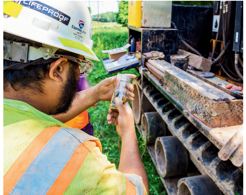
Not project specific.

Visit our website at DominionEnergy.com/line254 for project updates. Or contact us by sending an email to powerline@dominionenergy.com or calling 888-291-0190.