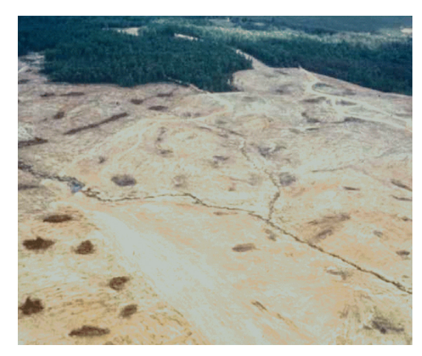
The clearing of Lake Anna's bed started in 1968. This photo captures the clearing of the lake bed where the Pamunkey Creek and North Anna River intersect at Spotsylvania and Louisa County.