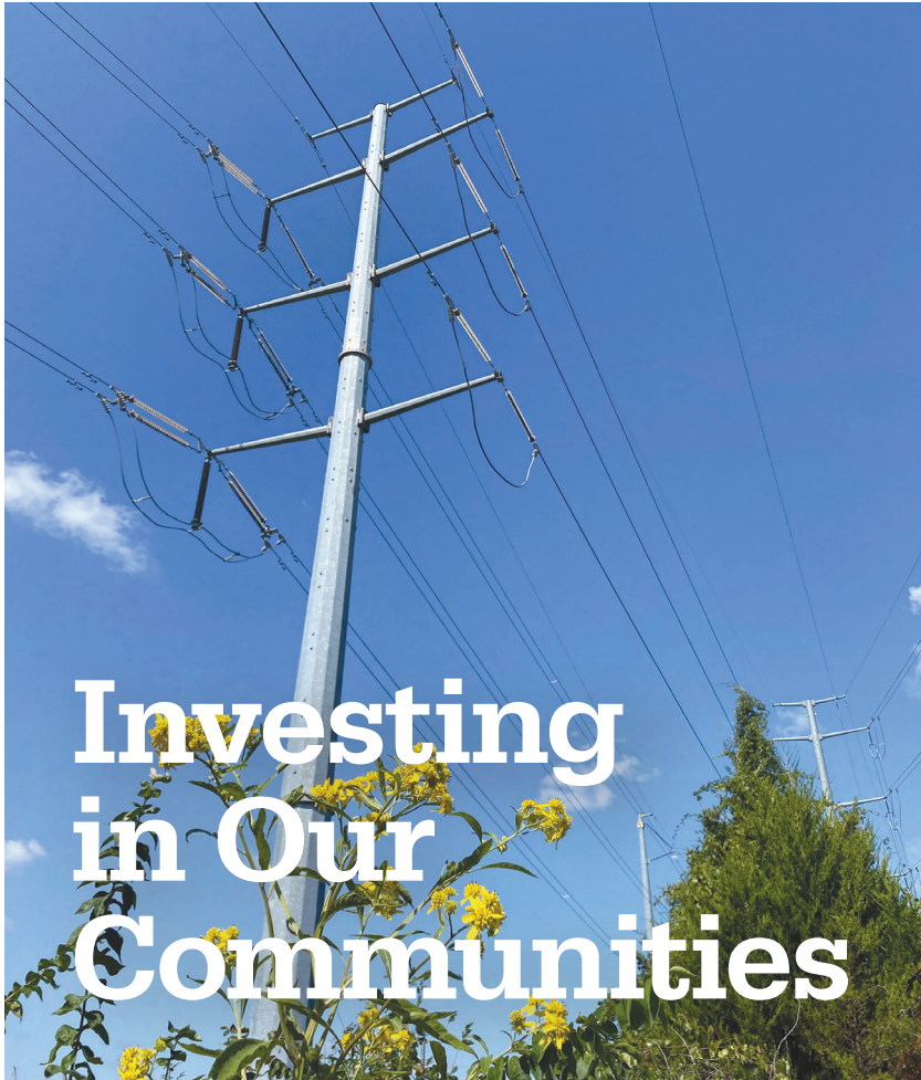
Not project specific.

Electric Transmission P.O. Box 26666 Richmond, VA 23261